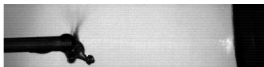
Fig. 1: An illustrative image of the transient spark interaction with water, captured by an ultrafast camera.

Time-resolved optical emission spectroscopy was also used to study the influence of the water incoming to the reactor through the nozzle on the discharge characteristics. A significant increase in the intensity of H \alpha , Fe and Fe + lines was observed.